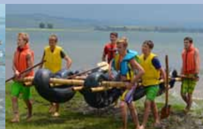
1st Hillcrest take line honours in the enduro race.